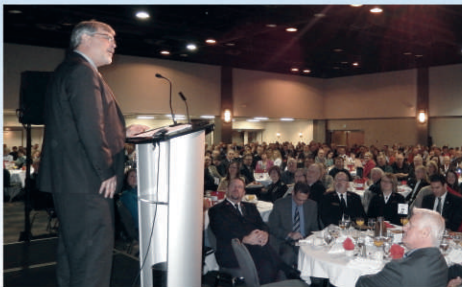
Captain Phillips recounting his experience with hijackers.

Guest speaker, Captain Richard Phillips, commanded the attention of his listeners with the account of being hijacked by Somali pirates in April, 2009. The first hijacking of an American vessel in more than 200 years, he was held captive for five days before being rescued by Navy SEALs in a